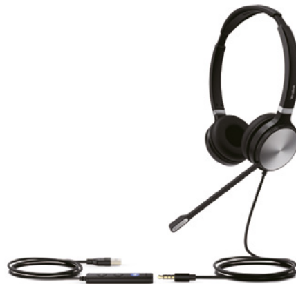
UH36 Dual Teams UH36 Dual UC