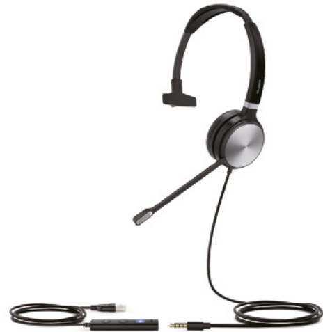
UH36 Mono Teams UH36 Mono UC

Deeply integrated with Yealink IP phones that the advanced features, such as volume synchronization and multiple calls control, are just right at your fingertips.